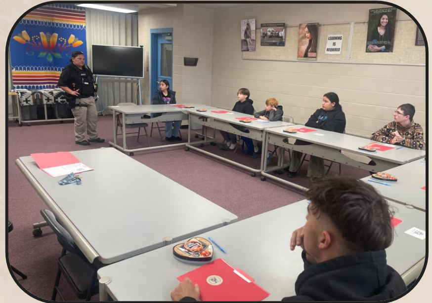
Lapwai School District Superintendent's Student Cabinet