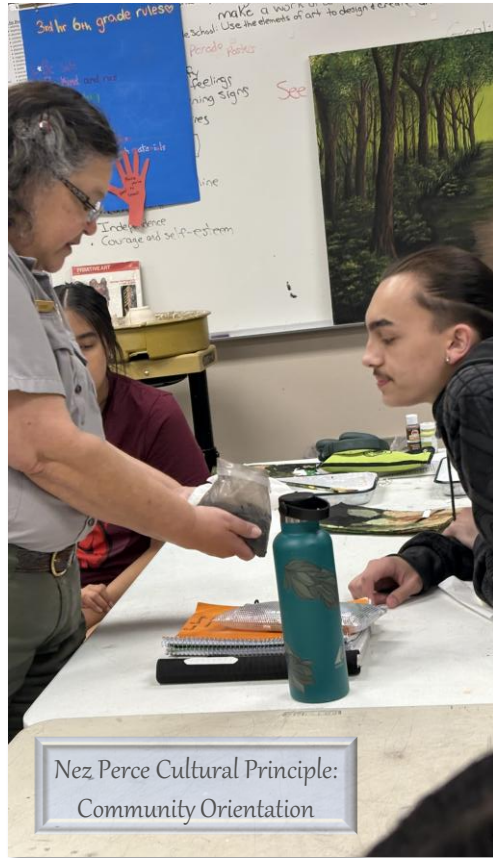
Nez Perce Cultural Principle: Community Orientation